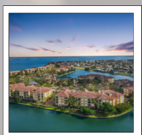
Vivante, Punta Gorda Storm Damage Assessment