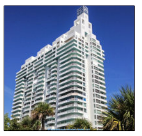
Southpointe Tower I, Miami Milestone Inspection Survey