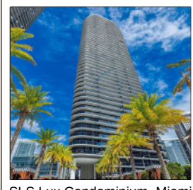
SLS Lux Condominium, Miami Turnover Study