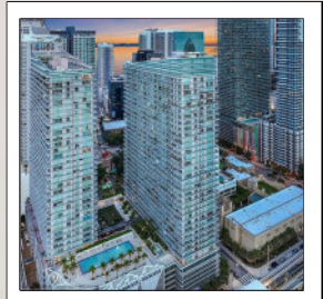
Axis on Brickell, Miami Façade Restoration and Paint