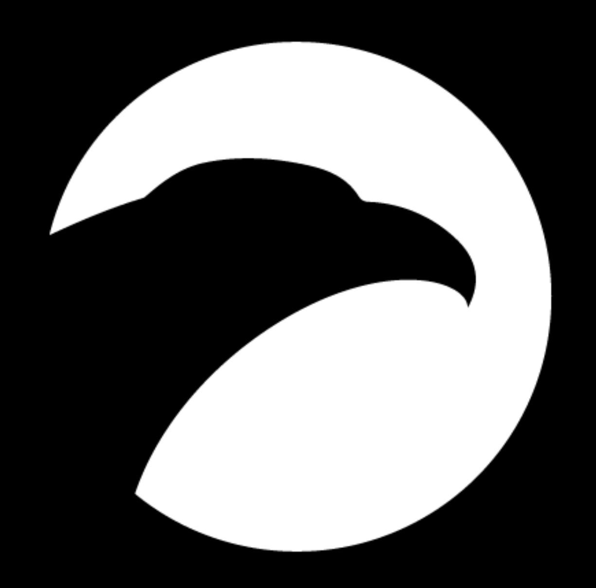
Providing Engineering Solutions for over 27 Years!