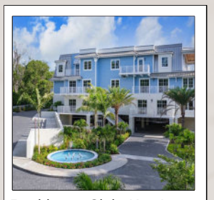
Residence Club, Key Largo Capital Reserve & Milestone Survey