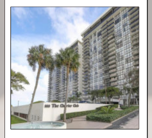
The Charter Club, Miami Building Recertification & Deck Repairs