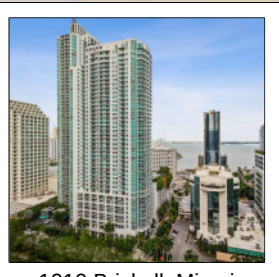
1010 Brickell, Miami Turnover Study