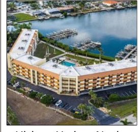
Hickory Harbor, Naples Storm Damage Assessment