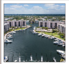
Yacht & Racquet Club of Boca Raton Structural Integrity Reserve Study